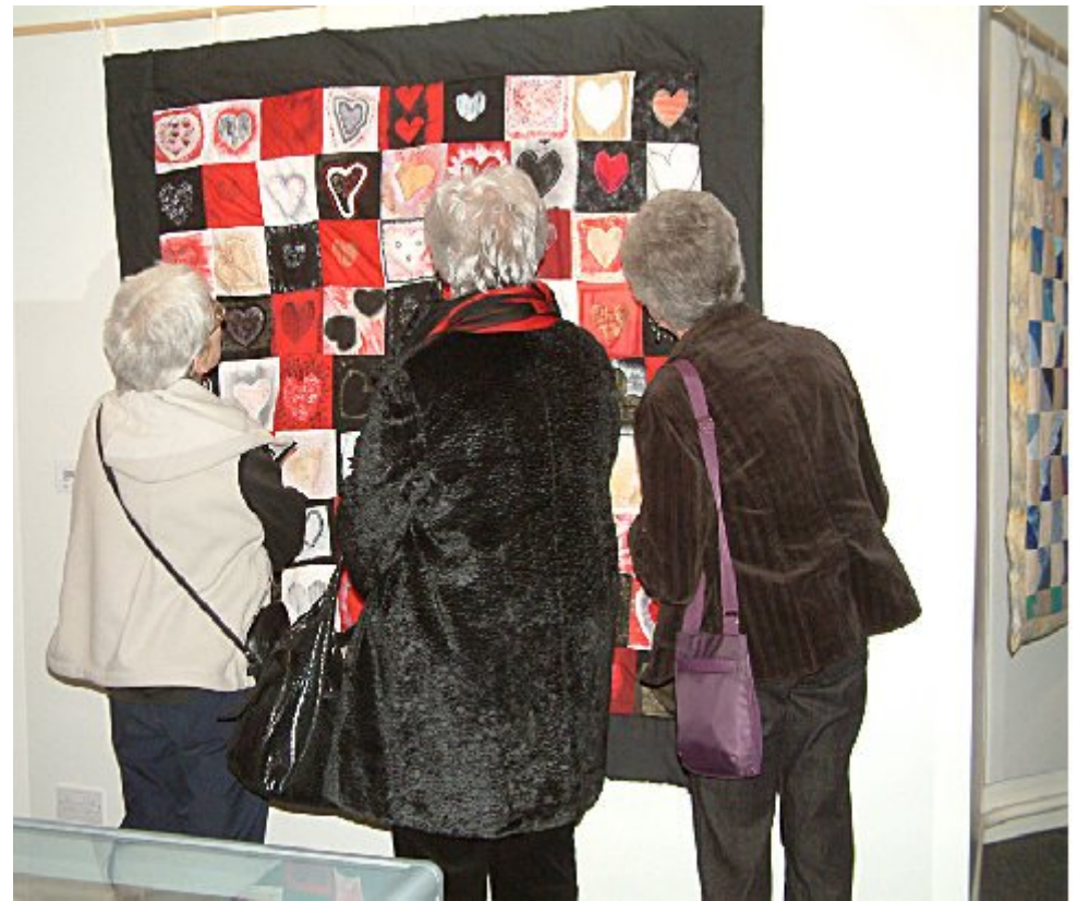
Guests at the opening admire one of the quilts

Before starting on their quilts, the class studied traditional Welsh quilt making. Their studies included a visit to Welsh quilt expert Jen Jones’s shop. They then worked individually and in groups to produce their own quilts. The exhibition shows a wide range of work from traditional patchwork to more adventurous batik-based designs. They are all very colourful and highly decorative and show a great deal of dedication on the part of the class